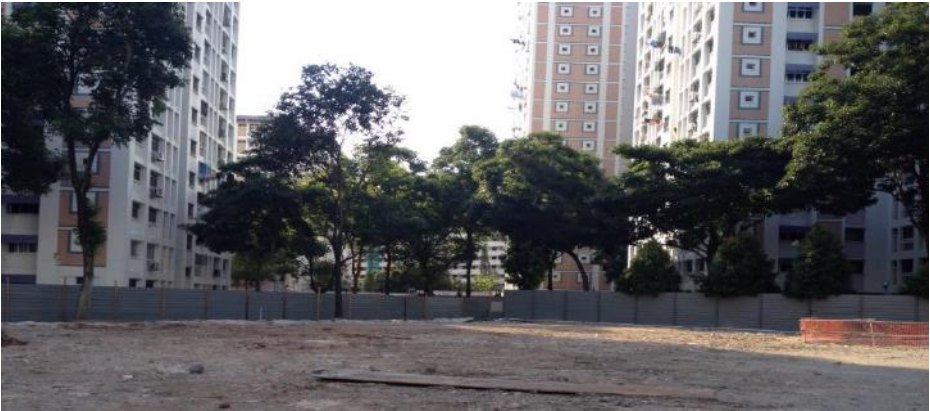
Land at 2 Tah Ching Road cleared for new building.