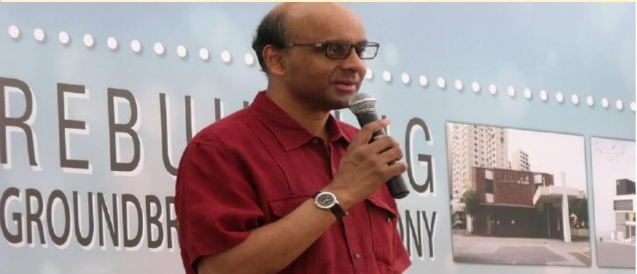
Mr Tharman Shanmugaratnam, Deputy Prime Minister of Singapore, at our Rebuilding Ground-breaking Ceremony on 24 th Jan 2015.