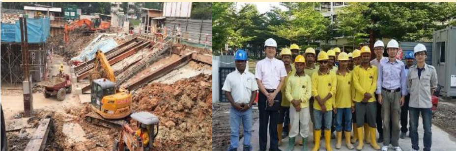
Construction work in progress.

Give thanks to God for the capable team of construction workers.